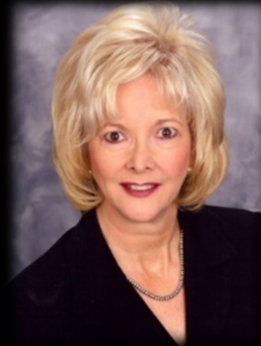
Debbie Hill Secondary Stroke Prevention Guidelines 2021