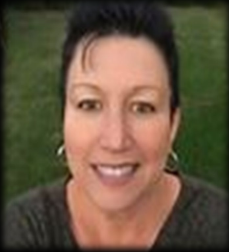
Theresa Conejo Chest Pain Guidelines 2021